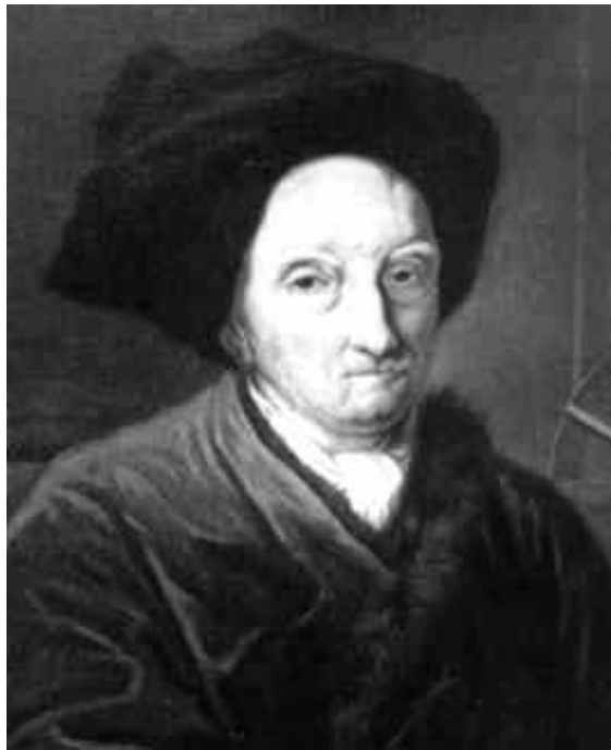
Figure 1. Bernard Le Bouvier de Fontenelle (1657–1757).