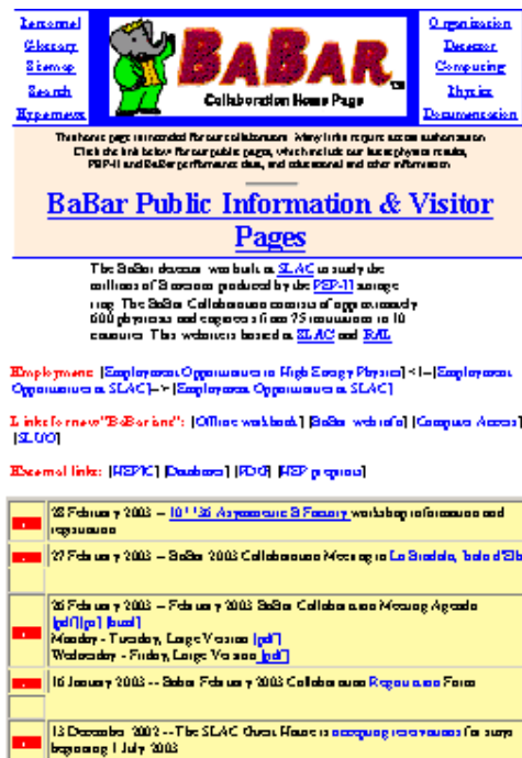
Figure 1 The BABAR Web Home Page ( http://www.slac.stanford.edu/BFROOT/ )

bureaucratic and hierarchical manner. For example, the primary funding agency for the BABAR experiment is the U.S. Department of Energy (DoE) which may view the BABAR Web site as a vehicle for providing a public persona and announcing the experiment's scientific successes. On the other hand, the hosting organization of the BABAR Web site (SLAC) is primarily interested in ensuring that the site operates effectively computationally while not providing a mechanism for system intrusion. Security is also a priority of the DoE which specifies policies to be followed by SLAC. These policies were developed by the DoE not only in regard to high-energy physics (HEP) research but stem from its role as custodian of the major U.S. national laboratories and address issues which may not be relevant to SLAC but must be adhered to nonetheless. Consequently, SLAC administrators' perceptions of operational and strategic problems facing BABAR Web administration are different from those of the BABAR users, as suggested, for example, by the observations listed in section 1.1.