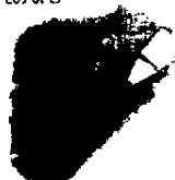
3-Piece Barbecue Tool Set 90 UPCs